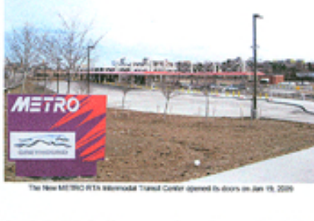
The new METRO RTA Intermodal Transit Center opened its doors on Jan. 15, 2009.

the METRO line-ups is a hazard of the past. There is even an onsite police station to provide security at all times.