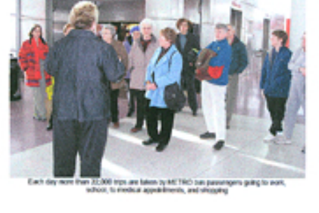
Each day more than 20,000 trips are taken by METRO on passengers going to work, school, to medical appointments, and shopping.