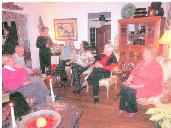
Conversation centered around almost anything but politics!

The deadline for the February Voter is January 15, 2011. Please email any materials to Diana Kingsbury at kingsbury.diana@gmail.com